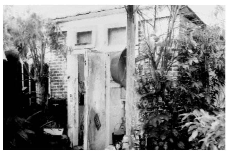
The last remaining public City Outhouse in Tltusville, above, is located on South Washington Avenue. Sold for $100, it is now used for storage.

The Brevard County Historical Commission desires to record the location of all privies or outhouses which may yet survive in Brevard County. The Commission would like to ensure that at least one or two of the structures are saved and restored for posterity.