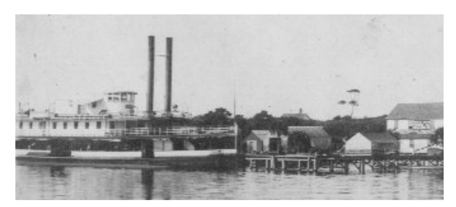
The steamer Swan lies at the dock of the Indian River Trading Company in Eau Gallie near the end of the 19th century. Eau Gallie was able to support big steamers like the Swan because the Eau Gallie River provided a deep enough harbor.

For many decades, the steamboat was king along Florida's Indian River, its booming voice bringing out entire towns to welcome passengers, freight, mail, and newspapers. It was the same when the first trains began to arrive just before the turn of the century, pushing steamboat service ahead of them and on down the coast.