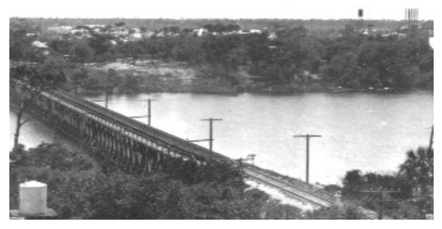
In the 1920s photo above, the FEC RR tracks cross Crane Creek going south into Hopkins. The mill town and its neighbor on the north side of the creek, Melbourne, heard the factory whistle from the Union Cypress Company. The water tower and 5 smokestacks of the mill can be seen on the horizon at the right.

The big whistle at the Union Cypress Company's mill in Melbourne could be heard in Eau Gallie, five miles to the north. Its unmistakable fire whistle would scream like a wildcat when calling for help. Guests at Melbourne's hotels and other winter residents, however, were "greatly annoyed" at being awakened along with the sawmill workers at 4:30 every morning. 2