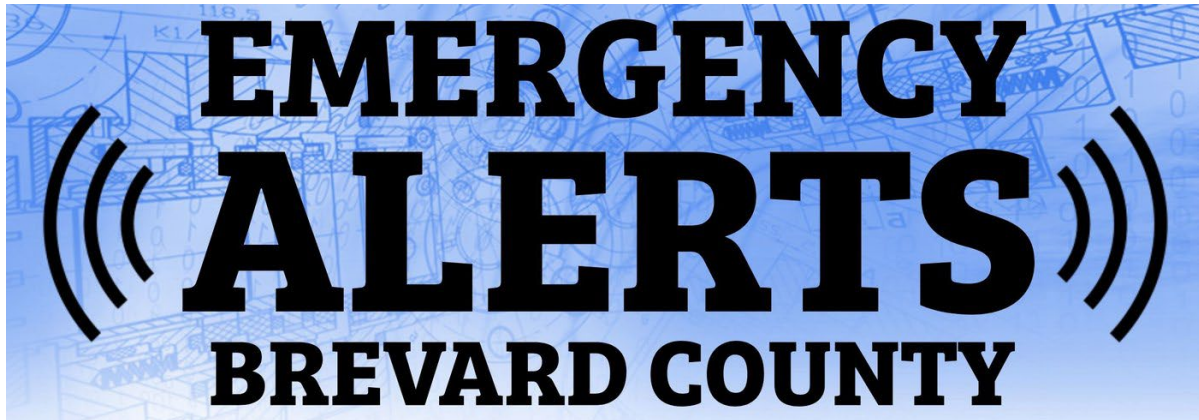
Figure 2. Emergency Alerts Brevard County

We encourage all interested customers to attend the Brevard County Board of County Commissioners regularly scheduled meetings held at the Viera Government Center. Please contact the County Manager's office at 321-633-2001 to confirm day, time, and location of the meetings.