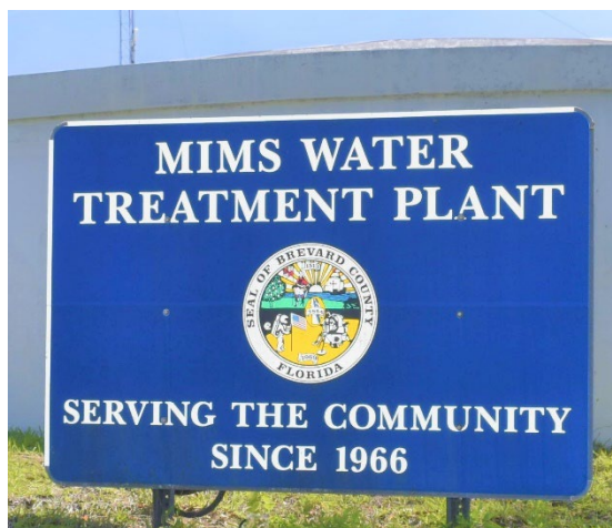
Figure 1. Sign for Mims Water Treatment Plant

contaminants in your drinking water according to Federal and State laws, rules, and regulations. Except where indicated otherwise, this report is based on the results of our monitoring for the period of January 1 to December 31, 2022. The state allows us to monitor for some contaminants less than once per year because the concentrations of these contaminants do not change frequently. Data obtained before January 1, 2022 and presented in this report are from the most recent testing done in accordance with the laws, rules, and regulations.