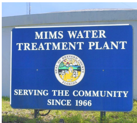
Figure 1. Sign for Mims Water Treatment Plant

Brevard County Utility Services Department is pleased to present this year's Annual Drinking Water Quality Report. This report is designed to inform you about the quality water and services we deliver to you every day. Our goal is to provide you with a safe and dependable supply of drinking water, and we want you to understand and be involved in the efforts we make to continually improve the water treatment process. We routinely monitor for contaminants in your drinking water according to Federal and State laws, rules, and regulations. Except where indicated otherwise, this report is based on the results of our monitoring for the period of January 1 to December 31, 2023. The state allows us to monitor for some contaminants less than once per year because the concentrations of these contaminants do not change frequently. Data obtained before January 1, 2023 and presented in this report are from the most recent testing done in accordance with the laws, rules, and regulations.