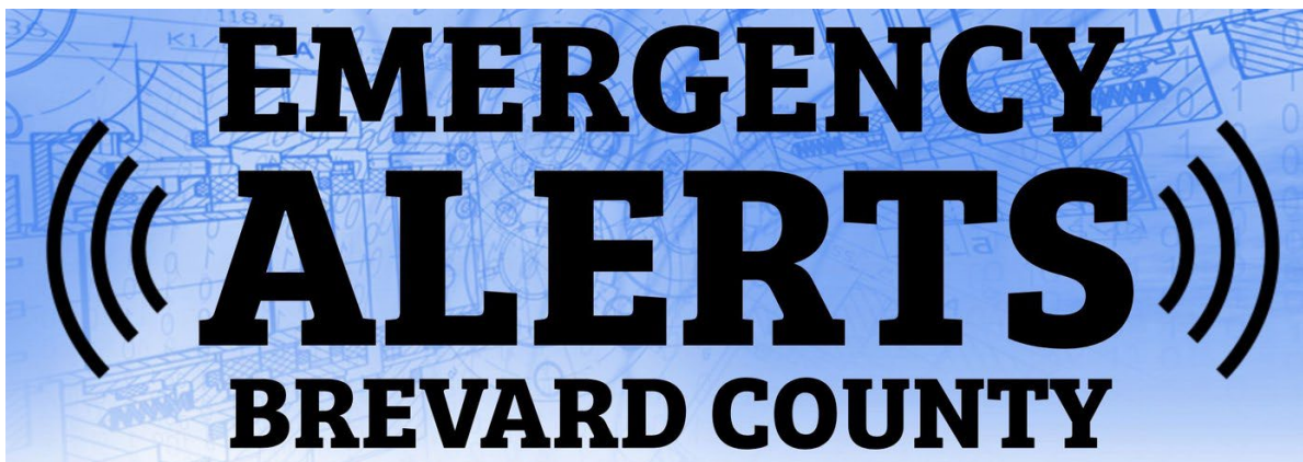
Figure 1. Emergency Alerts Brevard County

Did you know you can check on the status of Boil Water notices in your area at any time? Just call the Boil Water Notice Hotline at (321) 633-2118.